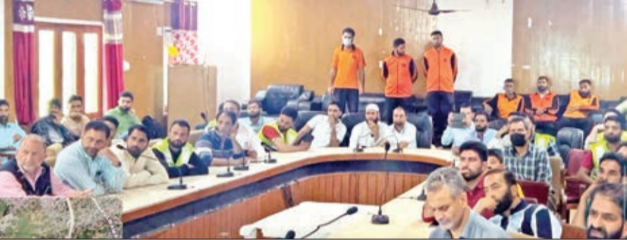
Civil Defence members with others at a programme.

■ STATE TIMES NEWS PULWAMA: District Disaster Management Authority (DDMA) Pulwama, in collaboration with the Civil Defence and SDRF component Pulwama/Awantipora, successfully conducted Capacity Building Programmes (CBP) on Disaster Preparedness and Response at Town Halls of Pulwama and