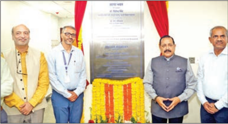
Union Minister Dr Jitendra Singh inaugurating the "Sagar Bhavan" and other first-of-its-kind facilities at the "National Centre for Polar and Ocean Research" (NCPOR) Goa, on Thursday.

documentary highlighting NCPOR's 25-year journey and took a virtual walkthrough of the upcoming museum, which is expected to offer immersive, science-based public engagement experiences. He also launched the "Science On Sphere (SOS)" initiative, a 3D visualization platform for displaying earth systems and climate-related data.