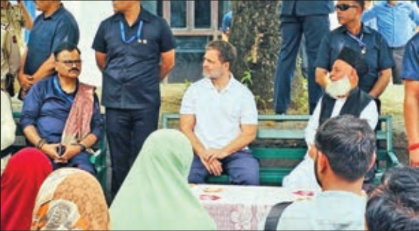
Congress leader Rahul Gandhi meeting with victims of cross-border shelling by Pakistan at Poonch.

Gandhi was accompanied by Jammu and Kashmir Jal