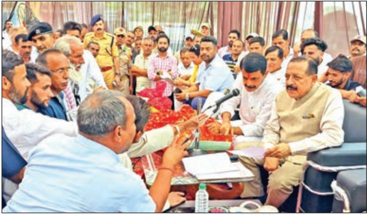
Union Minister Dr Jitendra Singh holding a Public Durbar at Billawar on Saturday.

Dr Jitendra further informed that one Armed Brigade had already been established at Sarthal and now another similar Armed Brigade has been set up in Rampur township of Billawar. This will not only provide round the clock army surveillance in the area but the Army personnel will also maintain regular liaison with the civil administration with the concerned Brigadier and the DM constantly being in touch with each other.