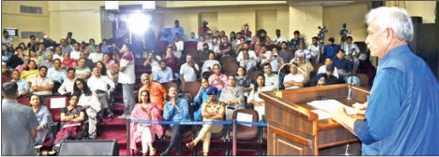
LG Manoj Sinha speaking at an event organised by Jammu University on Monday.

The Lieutenant Governor said that the representation