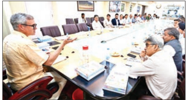
CM Omar Abdullah chairing a meeting at Srinagar.