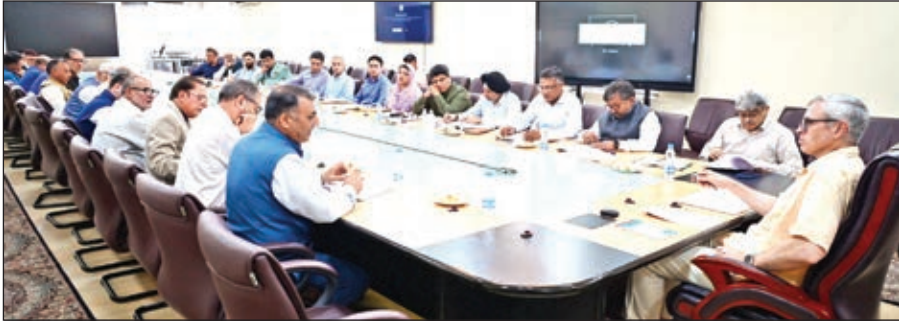
Chief Minister Omar Abdullah interacting with delegation of KCCI at Civil Secretariat.