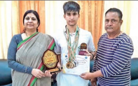
DPS Jammu faculty felicitating a winner student.