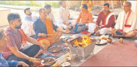
Committee members performing Hawan at Shri Shani Mandir, Bawa Kailakh.