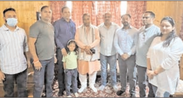
AJBRCEA delegation meeting with BJP J&K leaders.