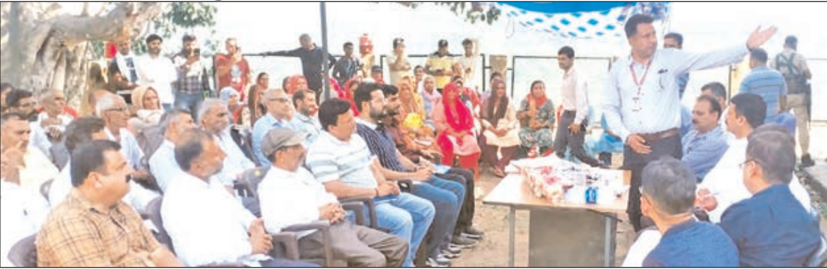
Officials educating farmers during the programme at Kathua.