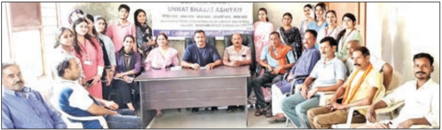
MIER college students and others at a programme.