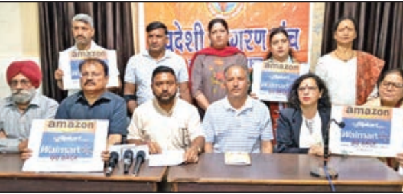
Swadeshi Jagran Manch members talking to reporters.