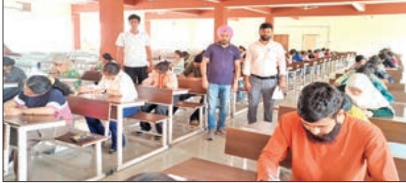
Students appearing in assessment.