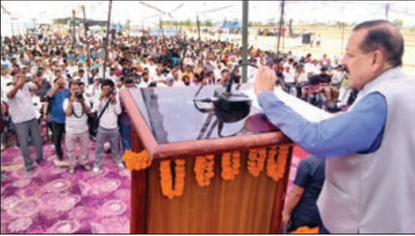
Union Minister Dr. Jitendra Singh speaking during Viksit Krishi Sankalp Abhiyaan at R S Pura, Jammu on Friday.

Dr. Jitendra quoted Prime Minister Modi's core governance mantra of serving the Women, Poor, Farmers, and Youth, and affirmed that 26 crore citizen have risen above the poverty line over the last decade through initiatives such as Fasal Bima Yojana, Nano Urea, and direct sup-