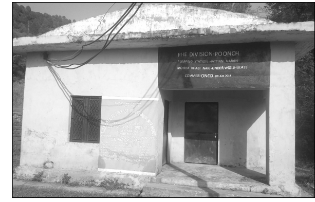
■ STATE TIMES NEWS

POONCH: The residents of village Jhallas Centre, Ward No 5 Poonch held a strong protest against the PHE department for its failure to provide water for the last one month.