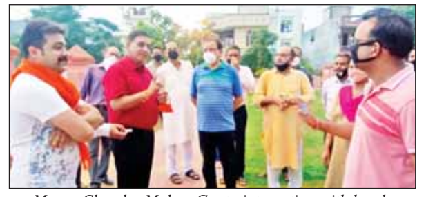
Mayor Chander Mohan Gupta interacting with locals at Narwal