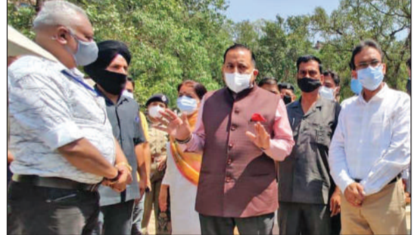
Union Minister Dr Jitendra Singh during a visit to the site of upcoming River Devika Project at Udhampur, on Saturday.

He said, he visualises the historic Devika Project not