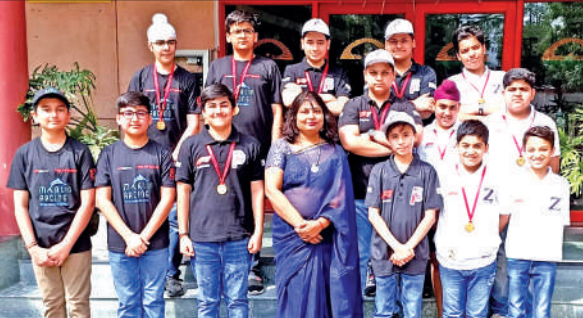
Winner Jodhamal School team posing with faculty members.