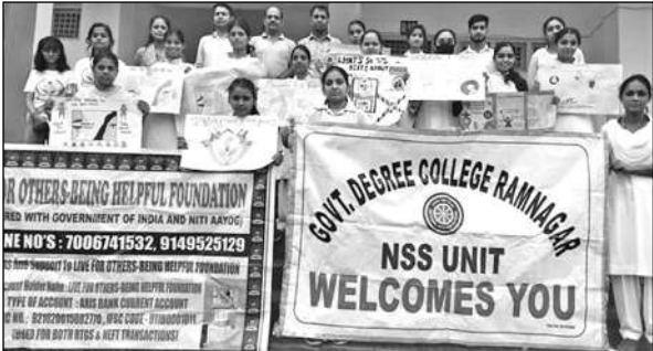
Faculty and students during the workshop.

On Day 1, an inter-college poster making competition was held. Devankshi of B.Sc VI