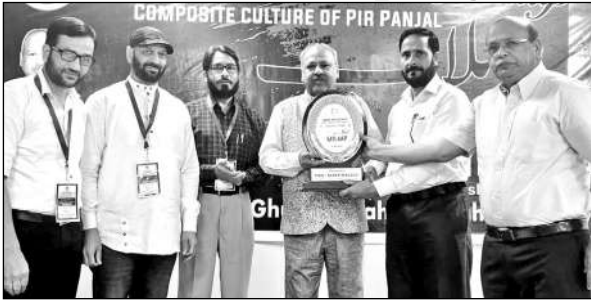
A dignitary being honoured during the programme.