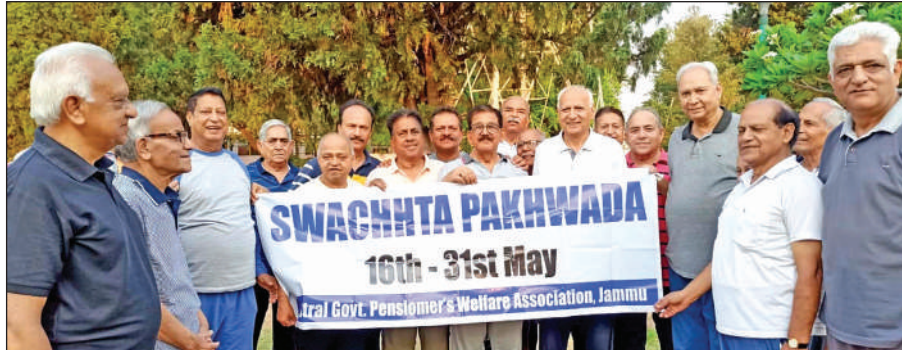
CGPWA members posing for a photograph during an awareness programme at Jammu.