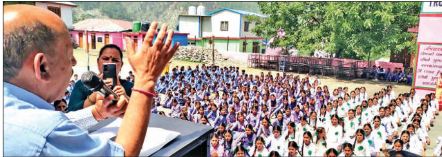
A dignitary addressing students during an awareness programme.