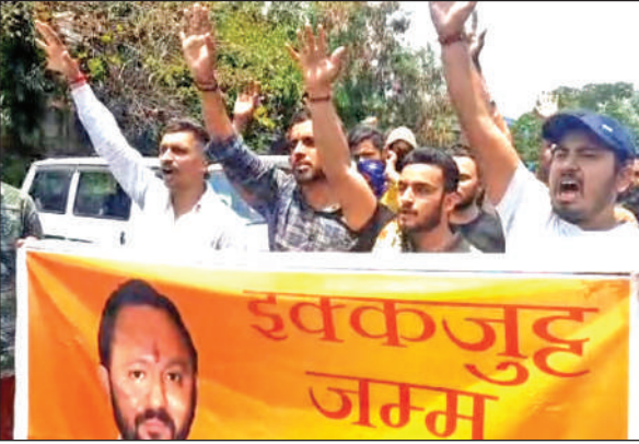
IkkJutt Jammu activists raising slogans during a protest.

The protesting members of IkkJutt Jammu party