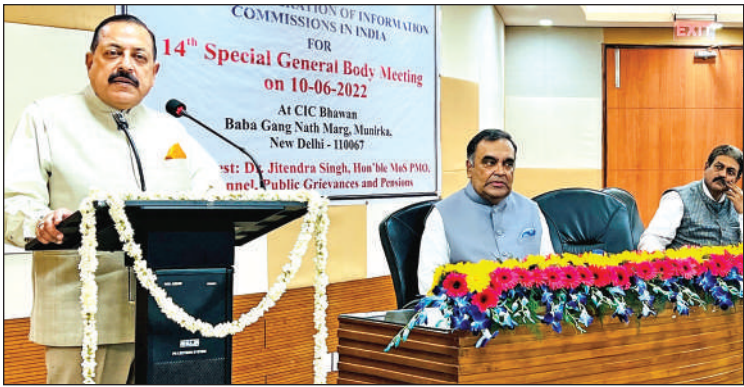
Union Minister Dr Jitendra Singh addressing 14th Special General Body Meeting of National Federation of Information Commissions of India (NFICI), at CIC Bhawan, Munirka, New Delhi on Friday.

The Union Minister said, ever since the Modi Government came to power