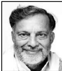
Prof. Bhim Singh (President and Founder of J&K National Panthers Party)