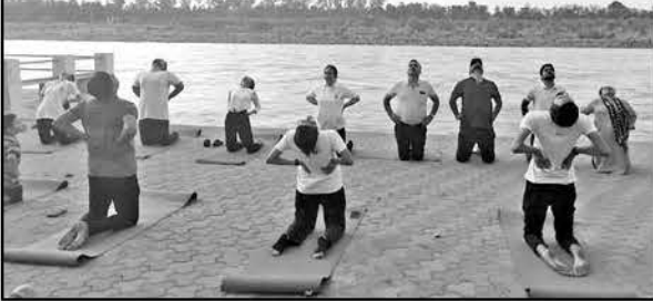
Participants performing Yoga Asanas during the camp.

AKHNOOR: Department of Swasthavritta and yoga Government Ayurvedic Medical college Akhnoor Jammu is conducting various yoga activities in different places in and around Akhnoor regarding upcoming International yoga day. In this context, a yoga awareness camp is organised Jia Pota Ghat Akhnoor. During the event, a live yoga session was conducted for the students, staff of GAMC Akhnoor, local people and staff of education department. During the session indication, contraindi-