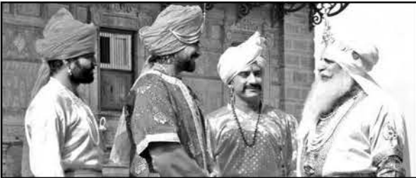
Artists performing during the play.