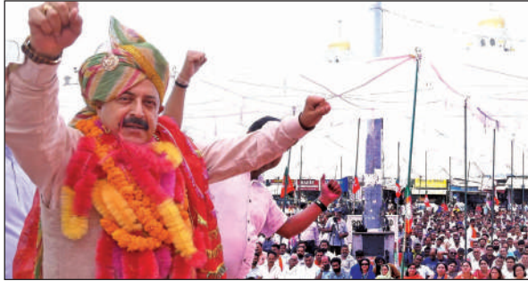
Union Minister Dr Jitendra Singh addressing 'Jan Kalyan' public rally, at Kathua on Tuesday.

Addressing mammoth 'Jan Kalyan' public rally organised by the BJP, Dr Jitendra Singh said that these 8 years witnessed unprecedented development and growth, but what is often not discussed is the subtle rise of self-esteem