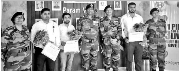
Volunteer blood donors being felicitated by Army officers.

The event was attended by a large number of Officers, JCOs & ranks of Udhampur garrison along with their families. The talk was well received by