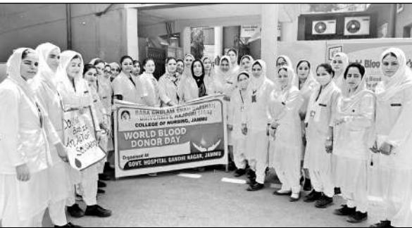
Students & staff of BGSBU Nursing College during an event.