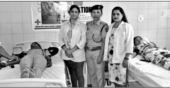
ITBP personnel donating blood at Udhampur.