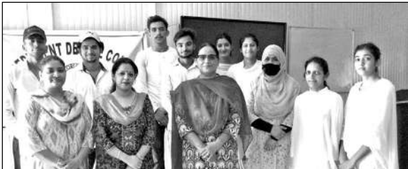
Students and faculty members after symposium.