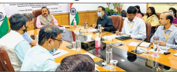
Union Minister Dr Jitendra Singh during an interaction with beneficiaries of "Bhavishya", the Portal for Pension Payment and Tracking System, at Sardar Patel Bhawan, New Delhi on Wednesday.

■ STATE TIMES NEWS NEW DELHI: Union Minister of State (Independent Charge) Science & Technology; Minister of State (Independent Charge) Earth Sciences; MoS PMO, Personnel, Public Grievances, Pensions, Atomic Energy and Space, Dr Jitendra Singh today announced that the Department of Pension & Pensioners' Welfare will soon launch Artificial Intelligence (AI) supported "Common Single Pension Portal" for the benefit of pensioners and elder citizens. This will also help seamless processing, tracking and disbursal of pension, he said. Interacting with beneficiaries of "Bhavishya", the Portal for Pension Payment and Tracking System, Dr Jitendra Singh said, in keeping with PM Narendra Modi's motto to ensure "ease of loving" for all, AI driven Portal will send automatic alerts to pensioners and their associations across the country but will also regularly receive their inputs, suggestions as well as grievances for prompt response. Most of the superannuated senior citizens including from paramilitary services and those about to get superannuation lauded the prompt pension processing through the Bhavishya platform and thanked the Union Minister for such seamless seva. Some of the hiccups from the banking side were brought to the notice of the Minister, which he said,