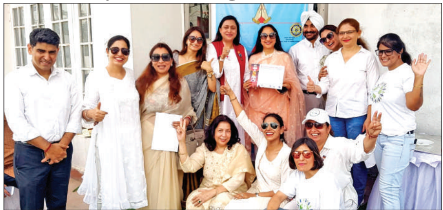
Members of Jahaan NGO & Rotary Club after blood donation camp.