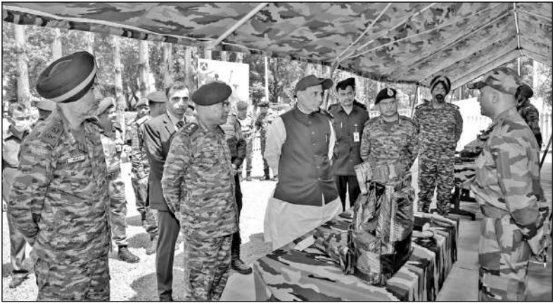
Defence Minister Rajnath Singh interacting with army personnel at Srinagar.

front against the Chinese aggression near Patrolling Point 14 in Galwan Valley. In November last year, he was posthumously awarded Mahavir Chakra, the second-highest military award for acts of gallantry in the presence of the enemy.