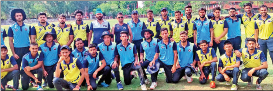
Teams posing alongwith coaches at GGM Science College Hostel Ground in Jammu.