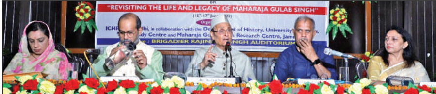
Dr Karan Singh speaking at closing ceremony of national seminar on 'Revisiting Life and Legacy of Maharaja Gulab Singh' at JU.