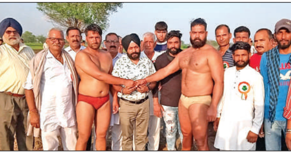
Chief Guest introducing wrestlers of main bout.