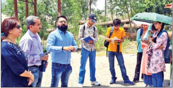
Students and faculty of Environmental Sciences Department JU at 'Edu-trip'

The purpose of the trip was to acquaint the students to our natural heritage and show them the traditional water conserva-