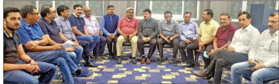
Industrial Associations Presidents and CCI office bearers during a meeting at Jammu.

The first issue is that pertaining to the demand for exempting industrial sector from proposed power tariff increase and second one is that of extension of validity of Provisional registration of industrial units.