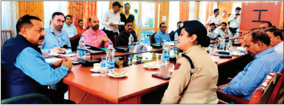
Union Minister Dr Jitendra Singh reviewing Amarnath Yatra arrangements and preparations with District Administration Ramban, on Sunday.

The Minister also stressed upon the district administration that social media should be used for updating Yatris with reliable related information by creating separate handles exclusively for this