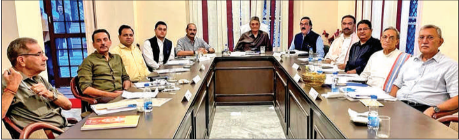
Chairman Trustee, Dr Karan Singh chairing J&K Dharmarth Trust Council meeting.