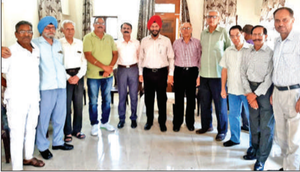
Retirees of Police League, District Jammu members during a meeting.