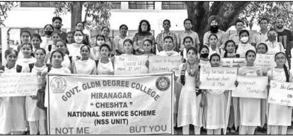
Faculty along with students during the programme.