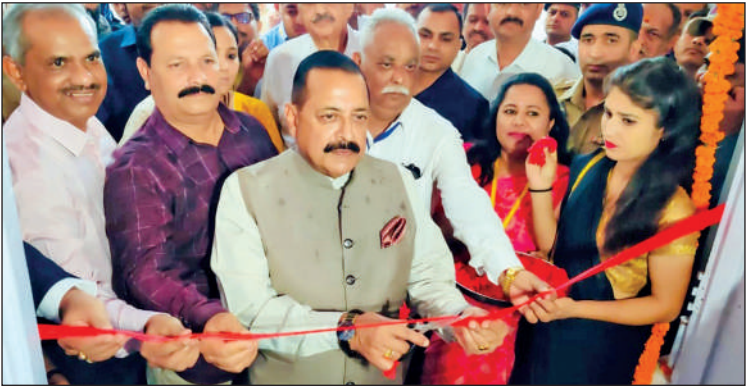
Union Minister Dr Jitendra Singh inaugurating "Earthquake Observatory" at Udhampur on Tuesday.

The Minister also said that in the last 7-8 years, departments that previously