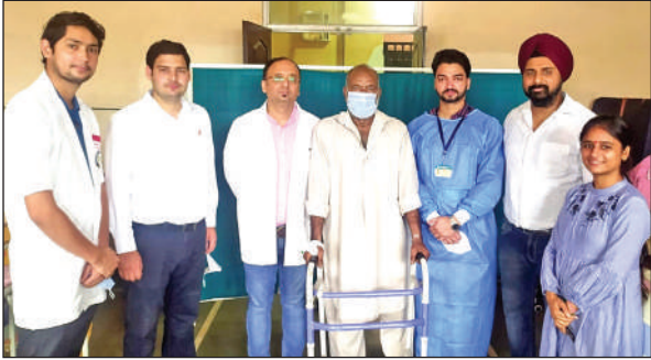
GMC Kathua doctors with patient after performing successful Total Hip Replacement Surgery.

Patient had initially consulted several private hospitals in Punjab where he was told that the cost of surgery would be around Rs 2.5 to Rs 3 lakh.