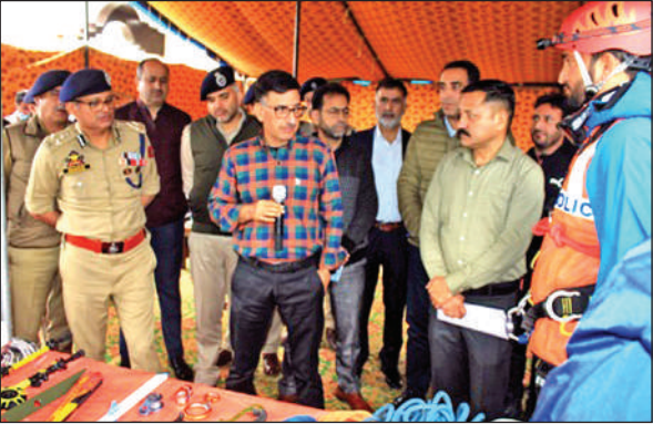
ADGP Armed J&K taking stock of preparedness of JKP MRTs for SANJAY-2022 duty.

While interacting with the team members, the ADGP