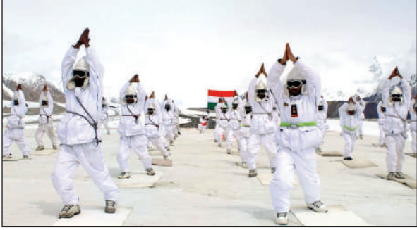
Soldiers performing Yoga Asanas at forward areas of eastern Ladakh.

Lt General Dwivedi is on a four-day visit to Ladakh. A large number of soldiers under the operational control of northern command and their families performed yoga with great enthusiasm throughout