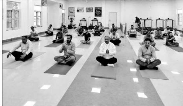
Yoga Day celebrations at BGSBU Rajouri.