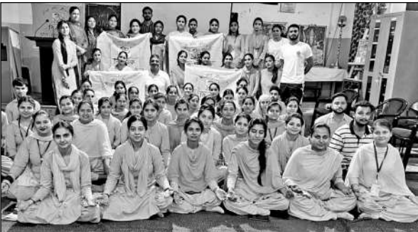
Yoga Day celebrations by Bhartiya Yog Sansthan, Udhampur.