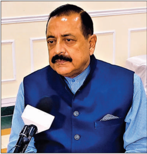
Union Minister Dr Jitendra Singh briefing media on "Purple Revolution" in J&K, at New Delhi on Wednesday.

Dr Jitendra Singh said, there is a need for wide-