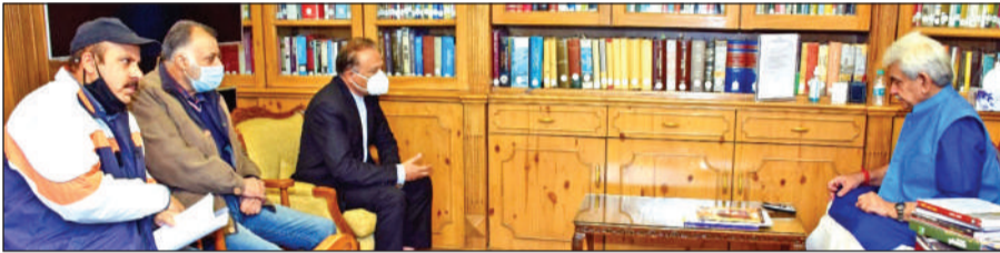
Delegation of Performing Artists & Film Makers of Kashmir calling on Lt Governor Manoj Sinha at Raj Bhavan.

tion expressed gratitude to Lt Governor for the recent Jammu Kashmir Film Policy introduced by the Government and hoped that it will give a much needed boost to the regional film industry, and the people associated with it.