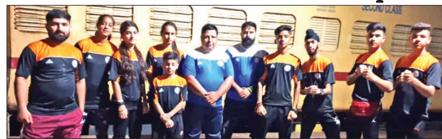
Karate team posing for a photograph with officials.