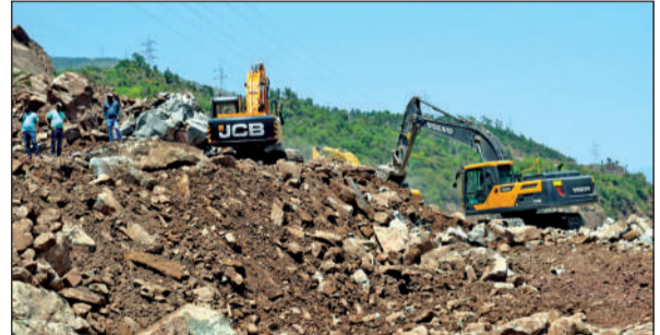
JCBs engaged in road clearance work on NH near Deval Bridge Samroli, Udhampur.

With improvement in weather, the restoration work at over half-a-dozen places in Udhampur and Ramban districts was speeded up in the morning as over 700