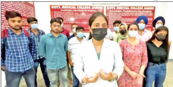
GMC Jammu students during a protest.

JAMMU: Doctors on Thursday staged a protest against the Jammu and Kashmir administration's proposed move to pool 50 per cent post-graduate seats from Government Medical College (GMC) and all seats of Sher-e-Kashmir Institute of Medical Sciences for all-India quota this year.