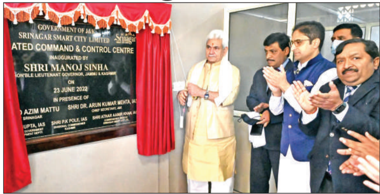
Lieutenant Governor Manoj Sinha inaugurating project under Srinagar Smart City.

SRINAGAR: Lieutenant Governor Manoj Sinha on Thursday said that ground-breaking technological interventions are bringing efficiency in urban governance and strengthening the response capability of various stakeholders. "Srinagar is embracing modern technical tools for sustainable and integrated urban living", the Lt Governor said while inaugurating two prestigious projects, the Integrated Command & Control Centre (ICCC) under the Srinagar Smart City initiative and Srinagar Municipal Corporation's Storm Water Drainage Scheme at Shalteng. Sinha said that real time data will ensure effective management of services like water, electricity, mobility, education, healthcare, environment, and security. "Turning Integrated Command & Control Centre as the Nerve Centre for all Smart City IT interventions, the Lt Governor said that the Centre will act as a situation room of the city, integrating civic operations and creating opportunity for data-driven decision making. The Lt Governor said, Srinagar Smart City aims to secure and increase livability, sustainability, efficiency for all citizens. The holistic approach in functioning of Srinagar Smart City will help in achieving five long term goals-smart mobility, smart economy, smart environment, smart living and smart governance. All stakeholders are working in tandem to make the Srinagar city a best