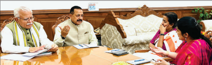
CM Haryana, Manohar Lal Khattar calling on Union Minister Dr Jitendra Singh at DoPT headquarters, North Block, New Delhi, on Friday.

Manohar Lal Khattar pointed out that there would be