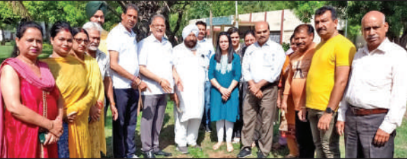
Former Dy CM, Kavinder Gupta and other at plantation drive.

■ STATE TIMES NEWS JAMMU: Senior BJP leader and former Deputy Chief Minister, Kavinder Gupta on Friday asserted that the next mission of BJP government led by Prime Minister Narendra Modi is to vacate Pakistan occupied Kashmir (PoK). The BJP stalwart was speaking during a plantation drive held as part of fortnight-long commemoration on the death anniversary of Dr SP Mukherjee. The plantation drive was conducted at GB Pant Hospital