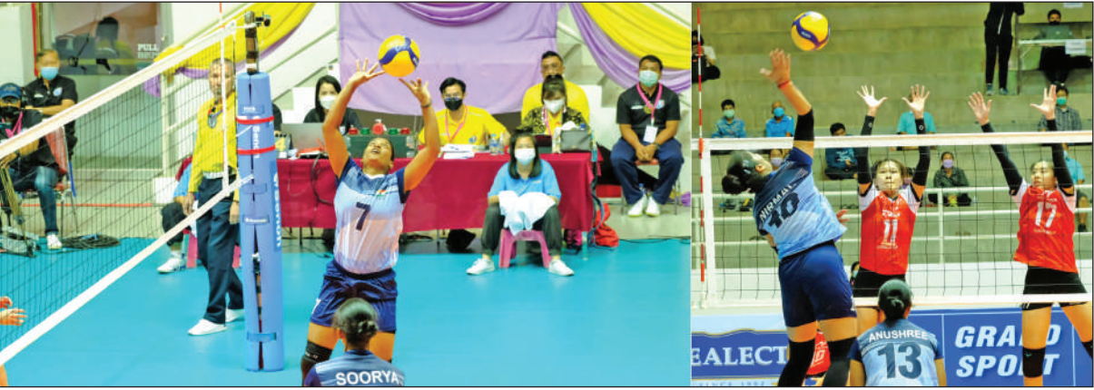
Indian players in action against Singapore during the opening match of third AVC Women's Challenge Cup.

■ STATE TIMES NEWS THAILAND: The Indian senior volleyball team beat Singapore 3-0 to start their winning campaign in the opening match of the