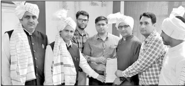
Pahari Tribe ST Forum delegation handing over memorandum to DDC Rajouri.

Pertinent to mention recently Jammu and Kashmir Socially and Educationally Backward Classes Commission has submitted its interim and supplementary reports to the Government on reservations to Other Backward Classes (OBCs) and