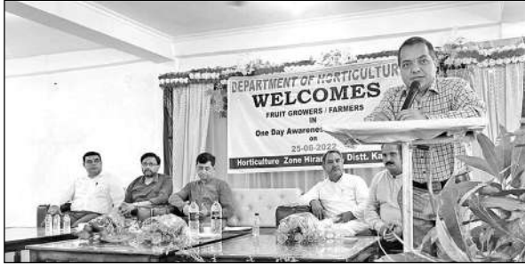
A resource person addressing the farmers.

While addressing a large gathering of farmers, Director Horticulture Jammu deliberated upon the various centrally and UT sponsored Horticulture schemes of the department in vogue. He urged them to adopt latest technologies in the field of Mechanization, High Density Plantation, Strawberry & Aloe vera cultivation, protected cultivation,