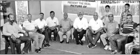
A section of dignitaries during the seminar.