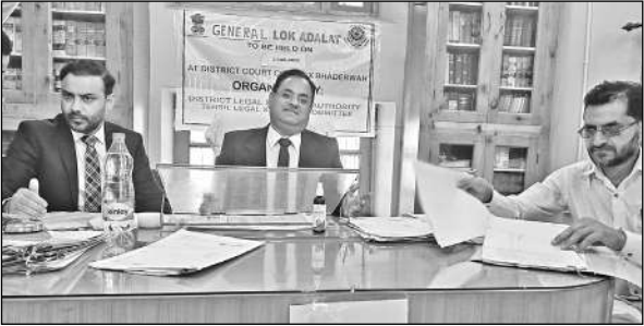
A bench during the Lok Adalat at Bhadarwah.