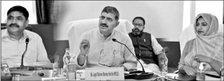
MP Jugal Kishore Sharma chairing a meeting at Poonch.

The MP sought details of steps taken to tackle water shortage in Poonch Town and directed SE Hydraulics to explore the possibility of construction of a filtration plant and Lift Scheme from Poonch River to provide clean drinking water to Poonch Township. He directed