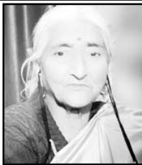
SMT PRABHAWATI PANDITA (KHAR)