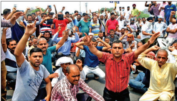
JSD daily-wagers blocking Tawi Bridge during a protest at Jammu.

JAMMU: Amid scorching heat, hundreds of daily wagers of the Jal Shakti Department on Wednesday staged a massive rally and blocked a vital bridge here, seeking fulfilment of their long-pending demands including regularisation and release of pending wages. The workers, who are on a tool-down strike for the past one week, assembled under the banner of Public Health Engineering (PHE) employees united front at the main office complex of the chief engineer at B C Road in the heart of the city before taking out the rally. Chanting slogans against the Lieutenant Governor-led administration and the BJP, the protesters tried to move towards the Civil Secretariat but were stopped by police personnel who were deployed in strength to maintain law and order. After a brief scuffle, the protesters managed to break the police cordon and moved towards Jewel Chowk where they blocked the Tawi bridge, causing a massive traffic jam in the