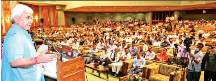
Lieutenant Governor Manoj Sinha addressing Kisan Maha Sammelan at SKICC Srinagar.

SRINAGAR: Lieutenant Governor Manoj Sinha on Wednesday said that braving all the challenges of agricultural reforms, the monthly farm income have improved and Jammu and Kashmir stands tall among top 5 states/UTs of the country. "In spite of rapid urbanization, nearly 70% population's livelihood is dependent on agriculture and it is the key to remove developmental imbalances between urban and rural areas. To some extent, this goal has been realized," the Lt Governor said at Kisan Maha Sammelan held at SKICC Srinagar. Sinha felicitated innovative, technically empowered farmers for their contribution to agriculture and horticulture sector. J&K has limitless potential in agriculture & concerted efforts are opening up doors of opportunity for small & marginal farmers. Never before had high-density plantation investment in agro-based industries taken place at the kind of speed witnessed in the last two years, observed the Lt Governor. He further said that Green Agriculture Revolution, and the contribution of Agricultural Universities, Institutions & Krishi Vigyan Kendras has changed the way of farming in an innovative way by extending benefits