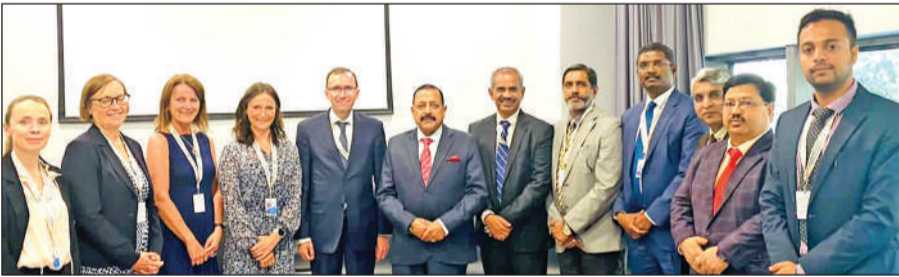
Union Minister Dr Jitendra Singh and his Norway counterpart Espen Barth Eide, along with their respective delegations, posing for a group photograph.