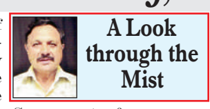
A Look through the Mist

And this 'mantra' ( Self Rule ) surely meant diluting the totalness of the 1947 accession of J&K with India n thereby finding some local acceptability as compared to Greater Autonomy of National Conference that called for just autonomy for government of the state from the central government. Support base of NC and the support-base of PDP are nearly same i.e Kashmir Valley and both the parties have lesser gravity of stakes in Jammu and Ladakh regions since voices if any