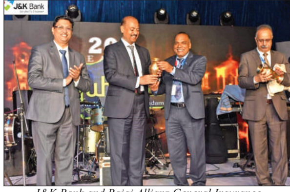
J&K Bank and Bajaj Allianz General Insurance representatives during a programme.

Through this two-decade long enriching partnership, together Bajaj Allianz and J&K Bank have stood by the citizens of J&K Union Territory through tumultuous natural calamities like floods witnessed in Leh, Keran, Jammu, Kashmir,