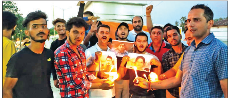
IkkJutt Jammu Party raising slogans during a protest.