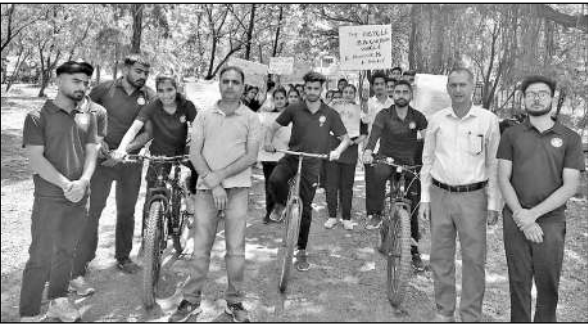
Faculty along with students during the rally.