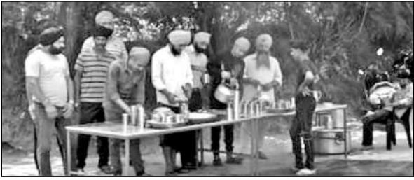
Sikh Sangat serving water among passersby.

■ STATE TIMES NEWS SUNDERBANI: On the occasion of Shaheedi Diwas of Guru Arjun Dev, committee members of Gurudwara Singh Sabha Beanigala and Sunderbani organised Shabeel near in front of Gurdwara Sahib and distributed sweet water to the all passers of this areas. The committee members said that they organised Shabeel during the Shaheedi Divas of our Guru in hot summer days.