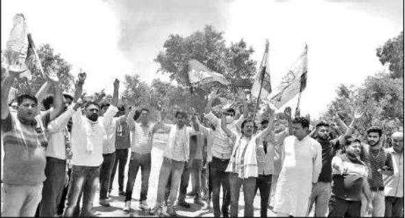
YC members staging protest at Kathua.

■ STATE TIMES NEWS KATHUA: Kathua Youth Congress staged a protest against the Jammu and Kashmir Union Territory Government and the Central Government for the unabated target killings in Kashmir and the government's utter failure to stop such killings. The protesting Youth Congress workers and activists raised vociferous slogans against the government and burnt the effigies of the Jammu and Kashmir Union Territory Government as well as the Central Government. It is pertinent to mention here that the protest was held on the directions of Uday Chib, Jammu and Kashmir Pradesh Youth Congress Committee (JKPYCC) President. The protesting Youth Congress