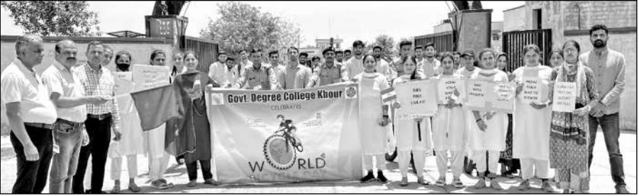
Faculty along with students during the event.