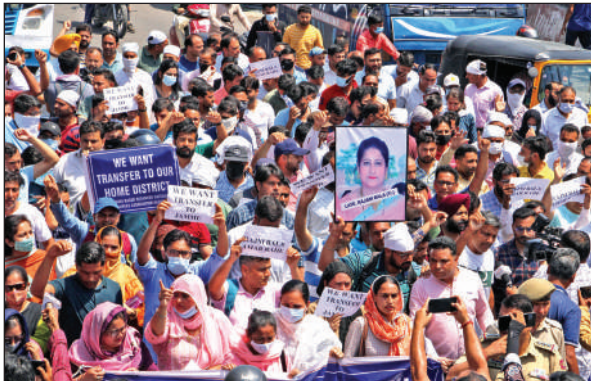
Government employees staging protest at Tawi Bridge in Jammu.