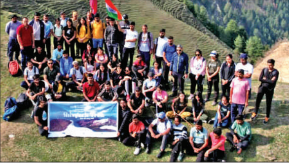
Trekkers posing for a photograph during Shivgarh Trek.

The students of SMVDU, hailing from Jammu & Kashmir, Bihar, Uttar Pradesh, Rajasthan,