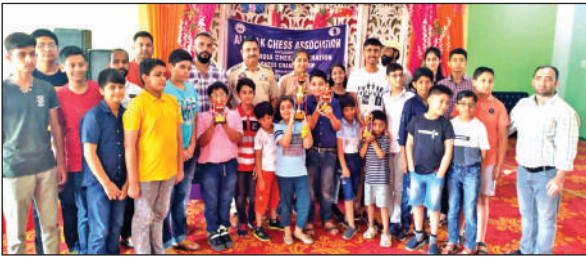
Winners posing for a photograph with dignitaries.