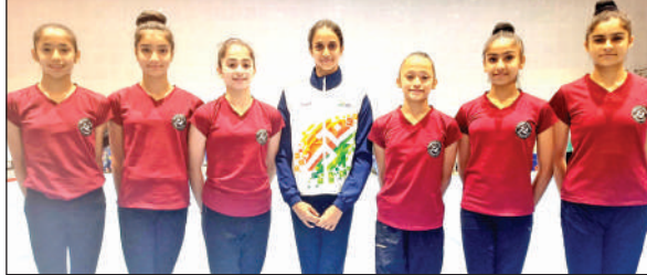
Selected J&K Gymnasts posing for a photograph.