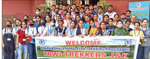
Trekkers posing for a photograph with officials.