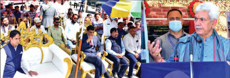
LG Manoj Sinha addressing after laying foundation stone of various projects under Srinagar Smart City project on Monday.