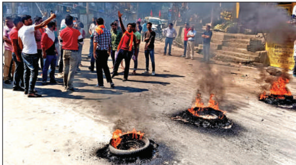
Shutdown, protests in Bhadarwah over alleged vandalism of temple on Monday.