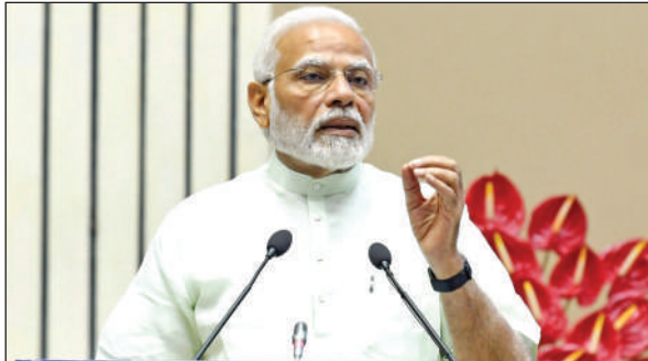
PM Narendra Modi addressing at the inauguration of iconic week celebrations of the Ministry of Finance and Ministry of Corporate Affairs, as part of 'Azadi Ka Amrit Mahotsav' (AKAM) in New Delhi.

extend these financial inclusion solutions globally, he said.