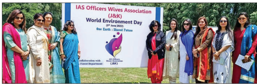
IASOWA members during World Environment Day celebration.

On the occasion while planting the tree saplings the Chief Secretary highlighted the sig-