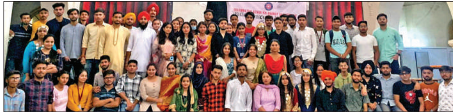
NSS volunteers of GGM Science College posing for a photograph.