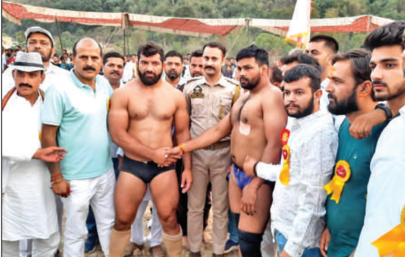
Wrestlers of main bout along with other dignitaries.