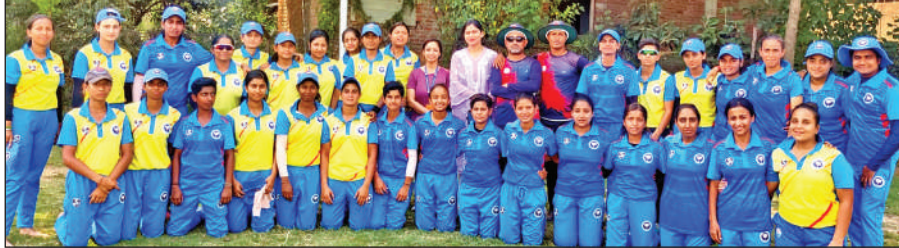
Teams posing alongwith selectors and other officials at University ground in Jammu.