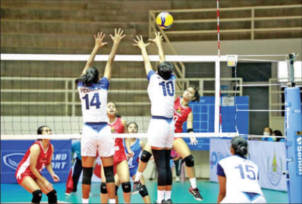
A match between India and Philippines in progress during 14th Asian Women's U-18 Volleyball Championship.

Prof. (Dr.) Achyuta Samanta, Member of Parliament & President, Volleyball Federation of India and other office bearers congratulated to all players