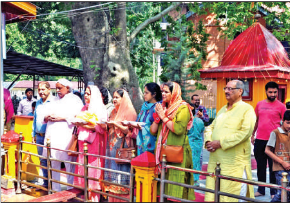
Devotees paying obeisance at Mata Kheer Bhawani Shrine at Tulmulla in Srinagar.

Kheer Bhawani is considered to be the deity of Kashmiri Pandits, who have a lot of recognition there. Jyeshtha Ashtami holds