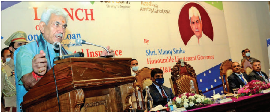
LG Manoj Sinha speaking during launch of Accidental Insurance scheme for employees.

J&K Bank, with a strong & diversified banking system and serving all sectors of the economy, is reaching out to all sections of society for financial inclusion & delivering financial services to the last man in queue, the Lt Governor observed.