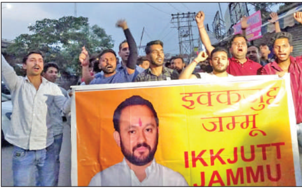
IkkJutt Jammu activists raising slogans during a protest.