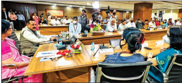
Union Minister Dr Jitendra Singh addressing senior officers of the Income Tax Department after launching 'Aarohan', a Coffee Table Book to mark 75th year of independence, at New Delhi on Wednesday.

today the number of people who are willing to pay income tax is increasing and the credit for this should go to PM Modi who took several path-breaking, courageous and confident decisions like introduction of GST in recent years.