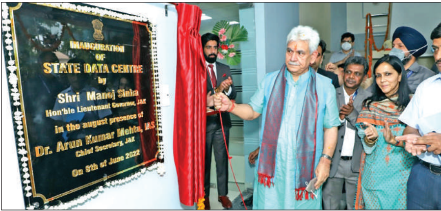
Lt Governor Manoj Sinha inaugurating State Data Centre at Civil Secretariat, Jammu.

Our aim under Digital India Mission in J&K UT is to make services faceless, paper-less & cash-less. This flagship programme is enabling technology empowered citizen-centric services, bringing government closer to the citizens and promoting citizen engagement, he added. The Lt Governor observed that Technology is a powerful agent of inclusive and sustainable growth. Major E-services are running parallel and compulsorily providing for feedback/rating system, helping the departments to