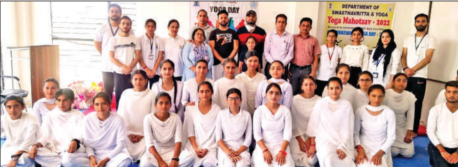
GDC Akhnoor students and faculty members posing for a photograph.