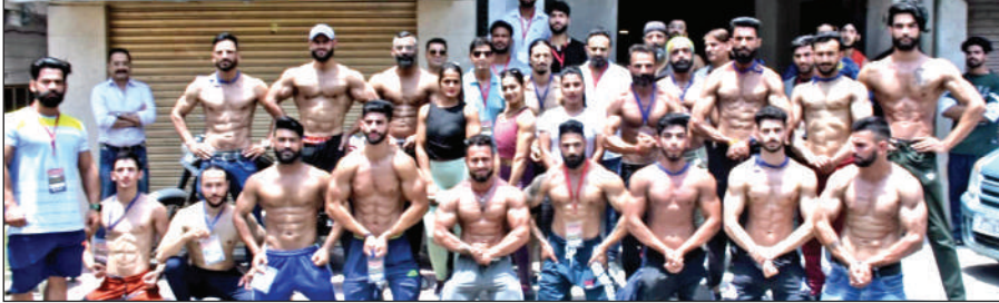
Bodybuilders posing for a photograph with officials after weighing.