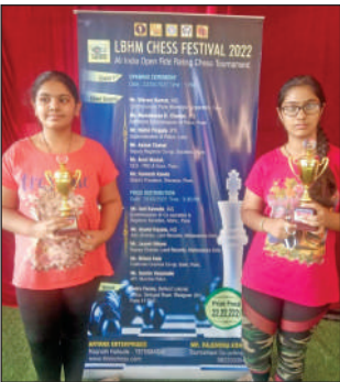
Winner DPS students.