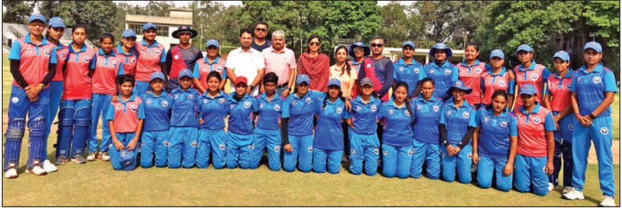
Players posing alongwith CAC Members and Selectors at JU grounds in Jammu.

final match at Sher-e-Kashmir Stadium, Ground-A Srinagar, JKCA B1 got the better of B2 by 79 runs.