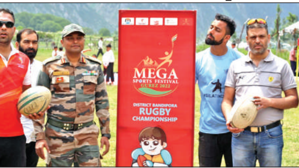
Army official along with others.