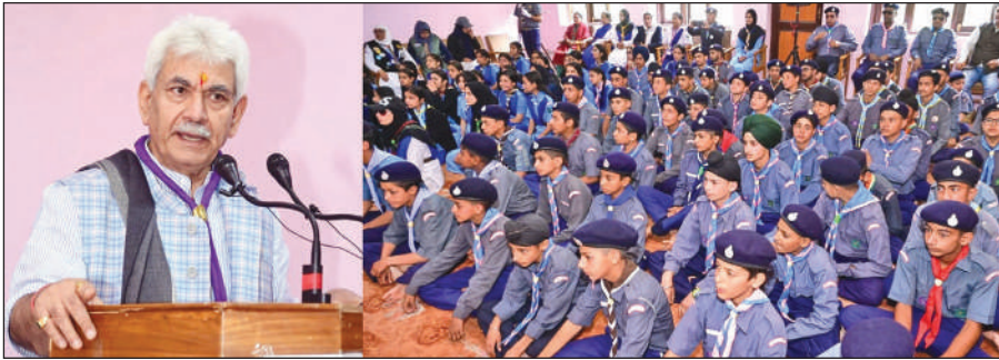
LG Manoj Sinha addressing Bharat Scouts and Guides UT level Camporee at Sonmarg on Wednesday.

He called upon the youth to join the campaign against drug addiction and help the