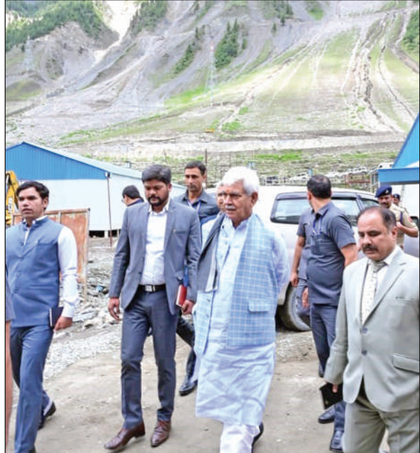
LG Manoj Sinha reviewing preparedness of Amarnath pilgrimage at Baltal on Wednesday.

The Lt Governor impressed upon the officials to ensure communication services on yatra route and night air services. He further directed